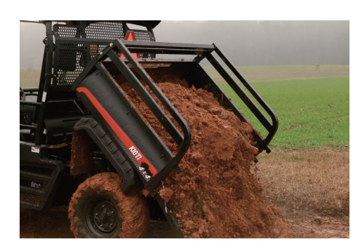
Cargo Bed The MECHRON provides excellent payload capabilities and has the widest cargo bed in its class. Add the optional hydraulic dump kit and you can easily

The heavy duty steel brush guard offers protection for the headlights and radiator from rocks, tough brush, and other debris on the trail.