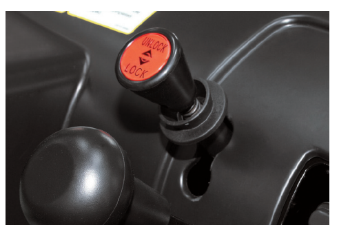
• Front: Limited Slip Differential

12-inch wheels and 25-inch tires provide a smooth ride and more ground clearance.