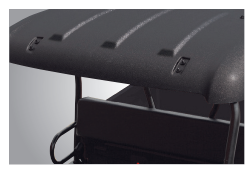
Canopy (Option) An impact resistant plastic canopy helps to protect the driver and passengers.

An in-line shift makes range selection simple and easy. 4WD selection and rear differential lock are engaged with a single pull knob.