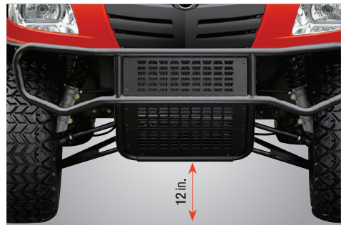
Ground Clearance Don't get stuck on the trail. With 12 inches of ground clearance, you can easily climb over obstacles